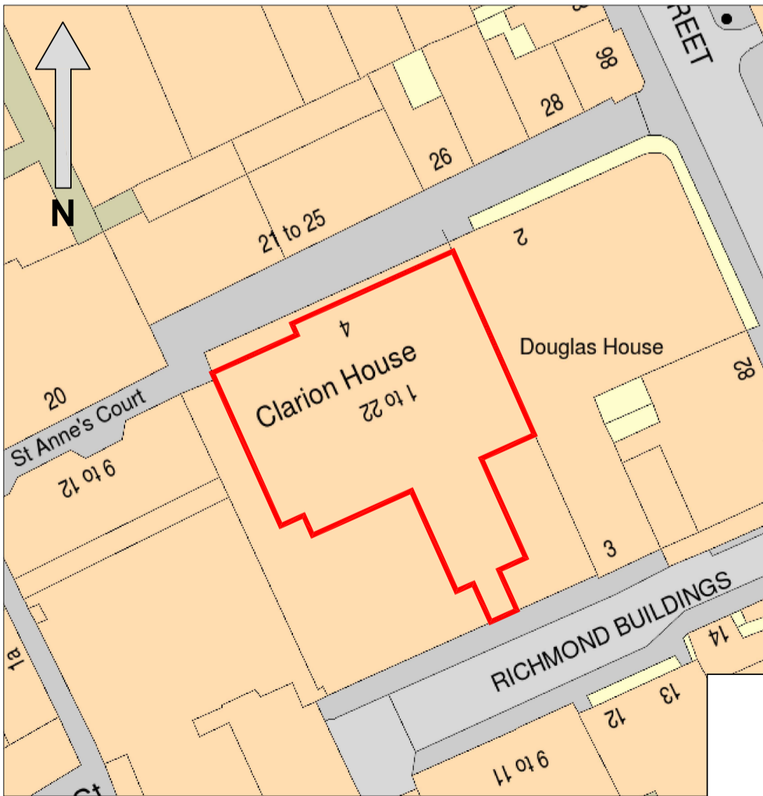
Location Plan Scale 1:500